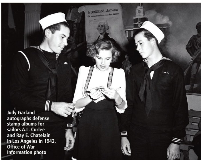
Judy Garland autographs defense stamp albums for sailors A.L. Curlee and Ray E. Chatelain in Los Angeles in 1942.

The starlet was commenting on the fact she’d let her hair go back to its natural dark brown after lightening it for The Wizard of Oz , proclaiming she liked things natural.