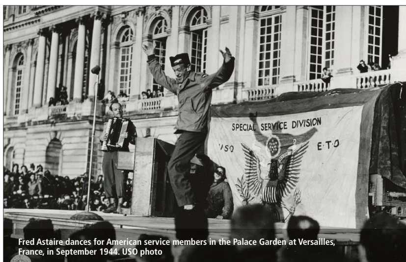
Fred Astaire dances for American service members in the Palace Garden at Versailles, France, in September 1944.

His group performed in France, Belgium and the Netherlands—when they could find an audience. “The Army was traveling so fast we couldn't catch up to them at first,” he wrote in his autobiogra-