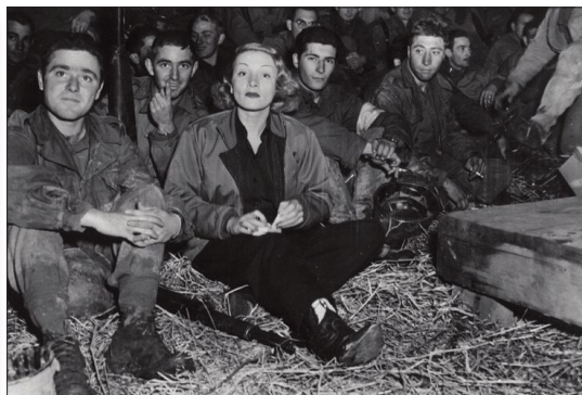
German-born actress Marlene Dietrich sits with the troops in France in 1944.

“They know weeks in advance that he is coming. It would be rather a terrible thing if he did not show up. Perhaps that is some of his drive. He has made some kind of contract with himself and with the men that nobody, least of all Hope, could break. It is hard to overestimate the importance of this thing and the responsibility involved. ... It has been interesting to see how he has become a symbol.”