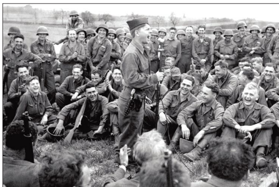
Mickey Rooney imitates some Hollywood actors for an audience of infantrymen in Germany in 1945.